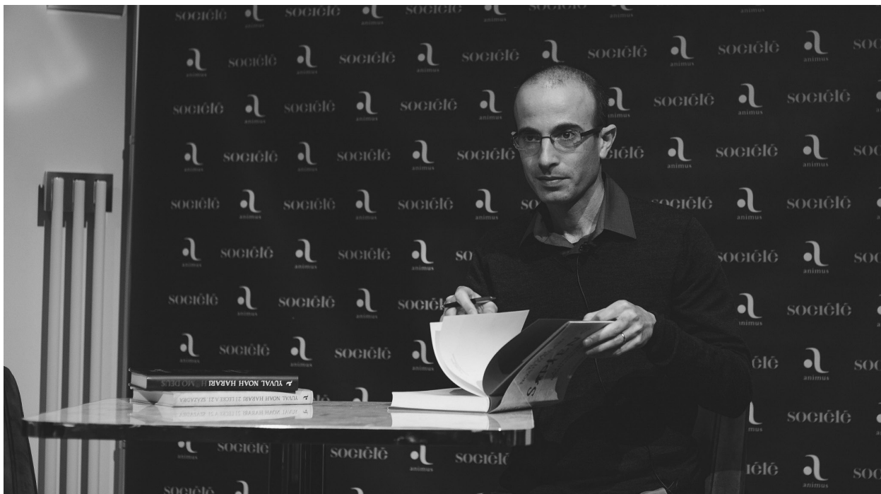
Prof. Harari at the press conference at SocietÉ Budapest.

For more information about Prof. Harari, visit his webpage: www.ynharari.com