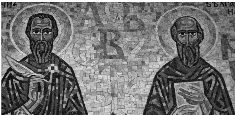
The mosaic of Saints, Cyril and Methodius.